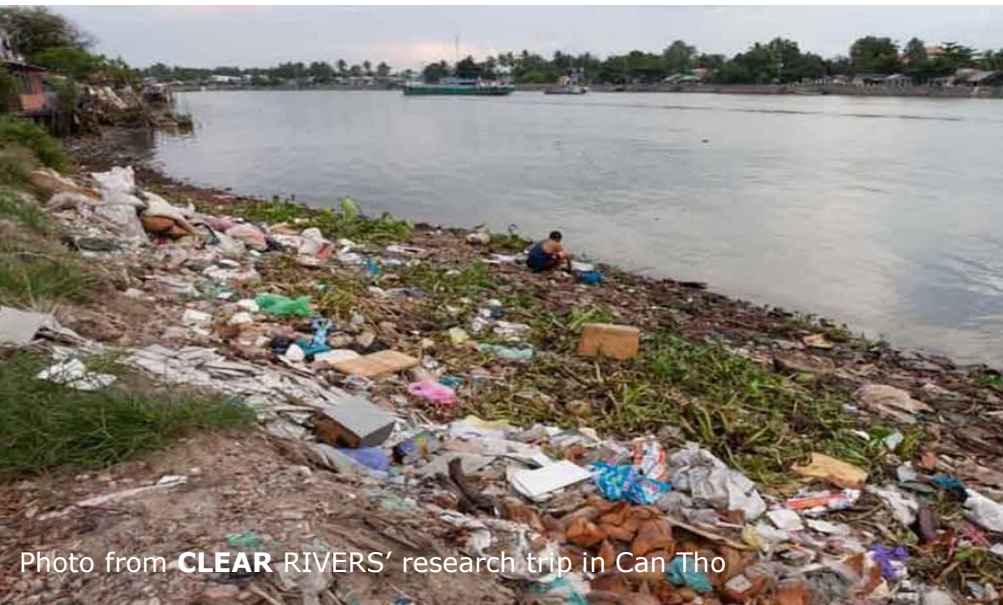
Photo from CLEAR RIVERS ' research trip in Can Tho