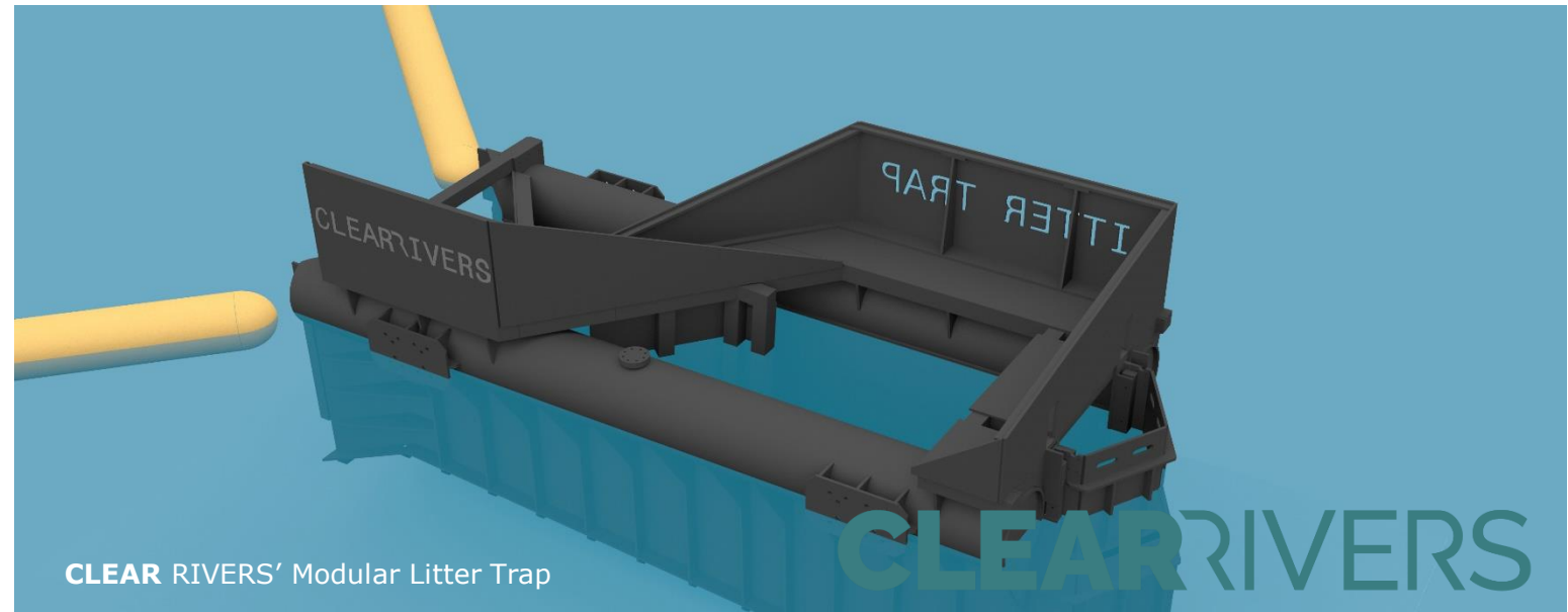
CLEAR RIVERS ' Modular Litter Trap